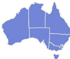
Outline of Australia