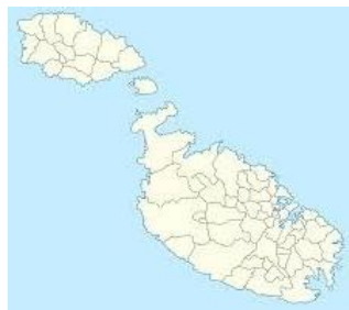
Outline of Malta